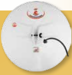
18-inch Monoloop (P/N 3011-0075) 18-inch Double-D (P/N 3011-0079)